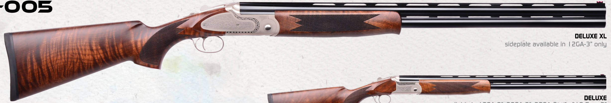
DELUXE XL sideplate available in 12GA-3" only