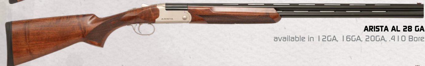
ARISTA AL 28 GA available in 12GA, 16GA, 20GA, .410 Bore