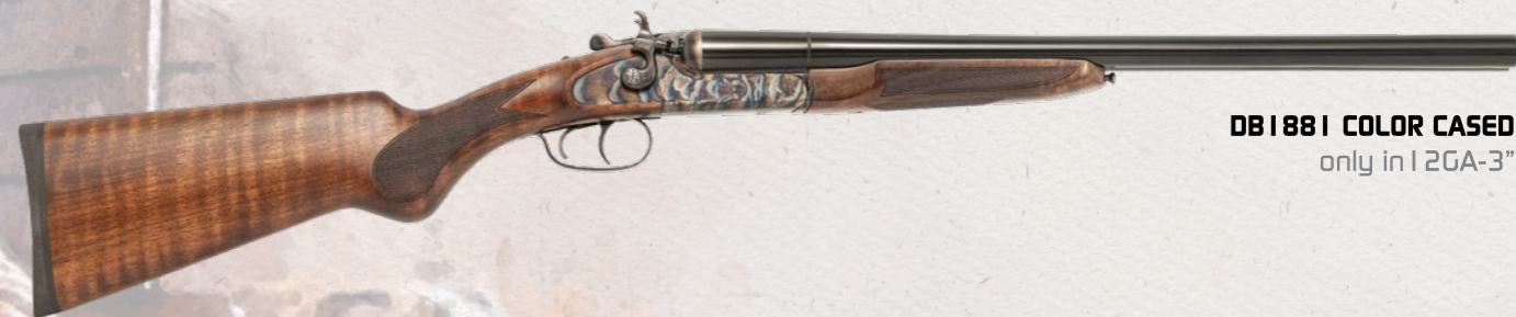
DB1881 COLOR CASED only in 12GA-3"