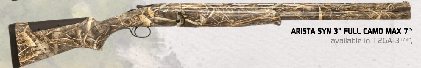
ARISTA SYN 3" FULL CAMO MAX 7® available in 12GA-3 1/2",