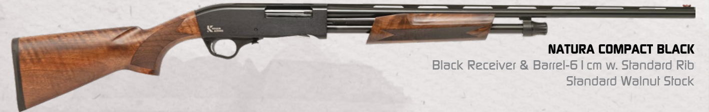
NATURA COMPACT BLACK Black Receiver & Barrel-61 cm w. Standard Rib Standard Walnut Stock