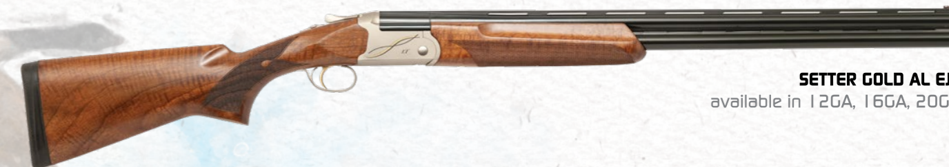
SETTER GOLD AL EJC available in 12GA, 16GA, 20GA

SETTER Aluminum or Steel receiver models feature an ultra light alloy or steel receiver with modern lines and laser engravings. It is accompanied by a simple but durable Extractor or Ejector on the barrel. SETTER has a sporty design barrel rib and a top lever, along with fine standard Turkish walnut stocks. It comes with fully rounded checkered forend anti-slip & machined fit microsystem recoil pad.