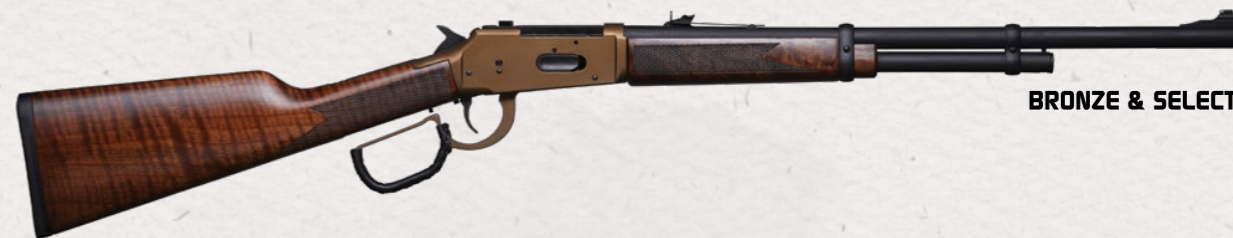
BRONZE & SELECTED WALNUT