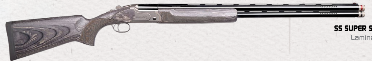
SS SUPER SPORTING Laminate Stock

K-005 is at the top of the line, delivering performance in elegance;