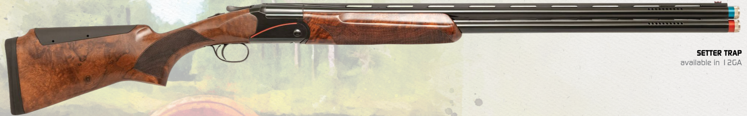
SETTER TRAP available in 12GA

SETTER SPORTING models feature a durable steel receiver with modern lines and laser engraving.