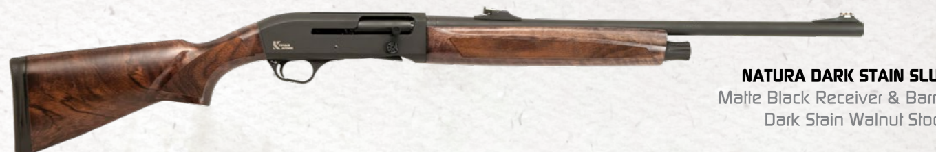
NATURA DARK STAIN SLUG Matte Black Receiver & Barrel Dark Stain Walnut Stock

Khan Arms presents the ultimate inertia system semi-automatic shotgun!