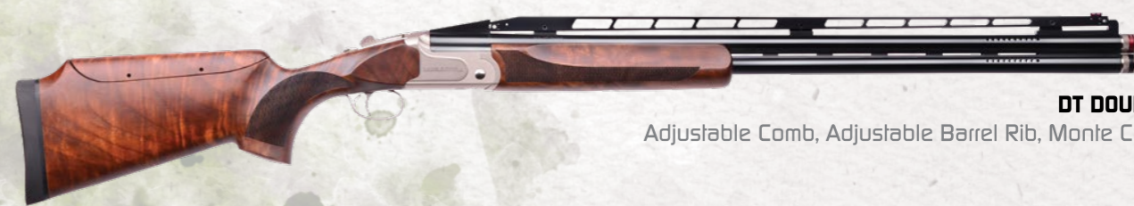
DT DOUBLE TRAP

Adjustable Comb, Adjustable Recoil Pad, Adjustable Barrel Rib