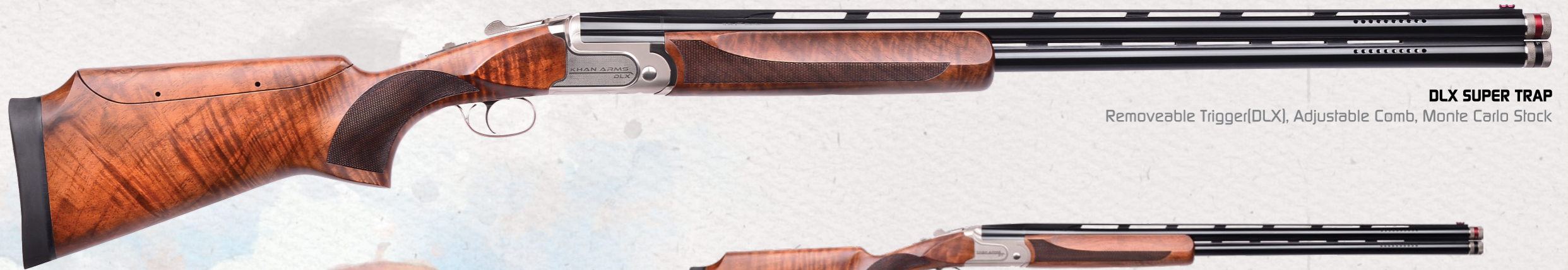
DLX SUPER TRAP Removeable Trigger(DLX), Adjustable Comb, Monte Carlo Stock