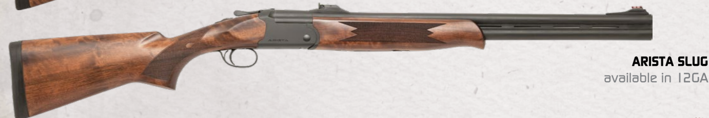
ARISTA SLUG available in 12GA