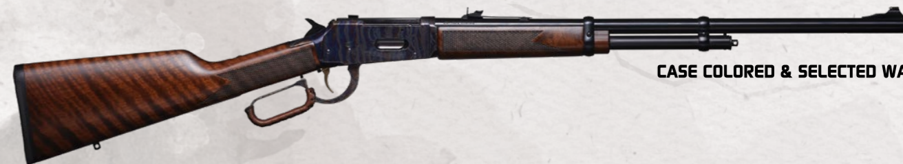
CASE COLORED & SELECTED WALNUT