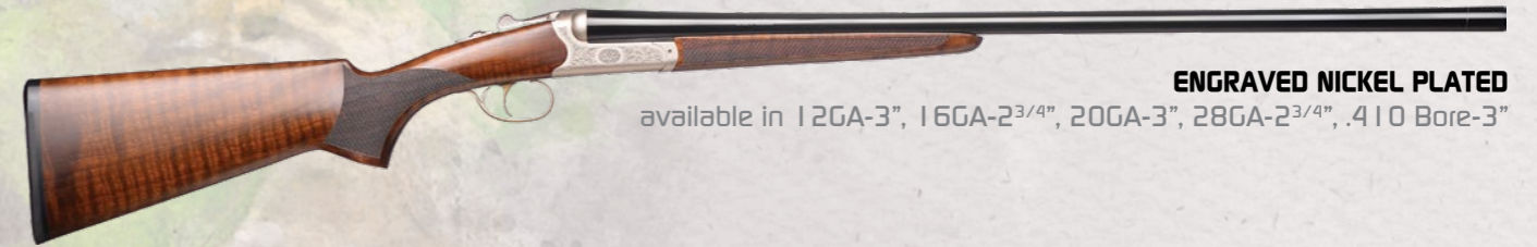
ENGRAVED NICKEL PLATED available in 12GA-3", 16GA-2 3 / 4 ", 20GA-3", 28GA-2 3 / 4 ", .410 Bore-3"