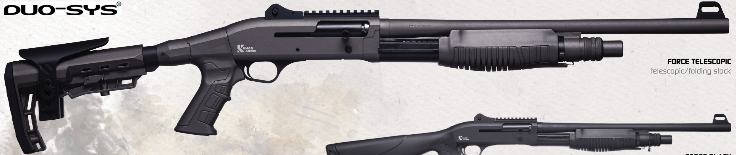
FORCE TELESCOPIC telescopic/folding stock