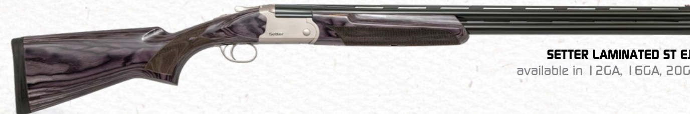
SETTER LAMINATED ST EJC available in 12GA, 16GA, 20GA