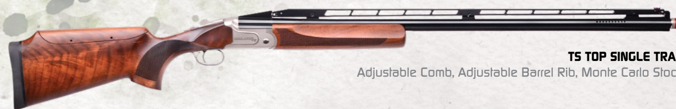
TS TOP SINGLE TRAP

Adjustable Comb, Adjustable Barrel Rib, Monte Carlo Stock