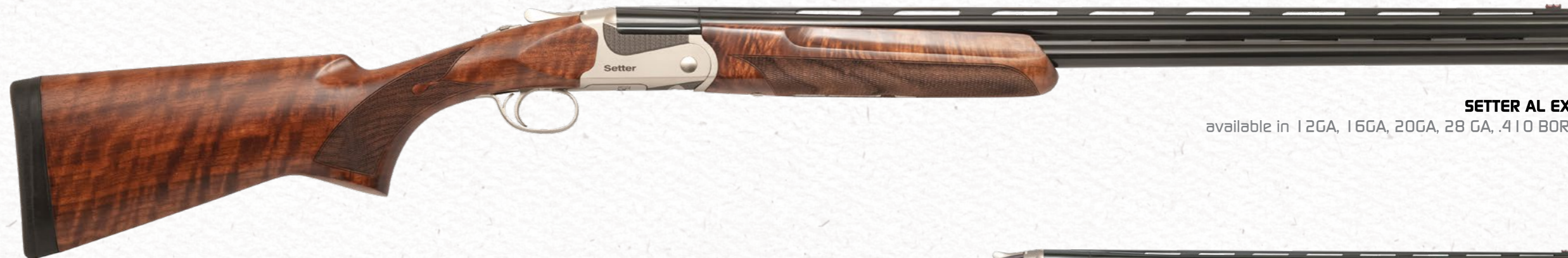
SETTER AL EXT available in 12GA, 16GA, 20GA, 28 GA, .410 BORE