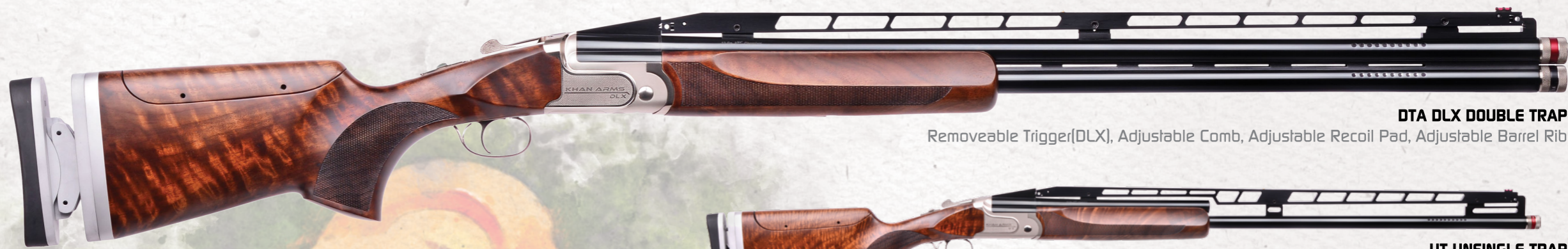
DTA DLX DOUBLE TRAP

Removeable Trigger(DLX), Adjustable Comb, Adjustable Recoil Pad, Adjustable Barrel Rib