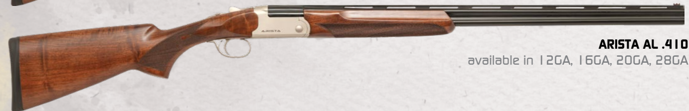
ARISTA AL .410 available in 12GA, 16GA, 20GA, 28GA

ARISTA line of products offer you simplicity, functionality;