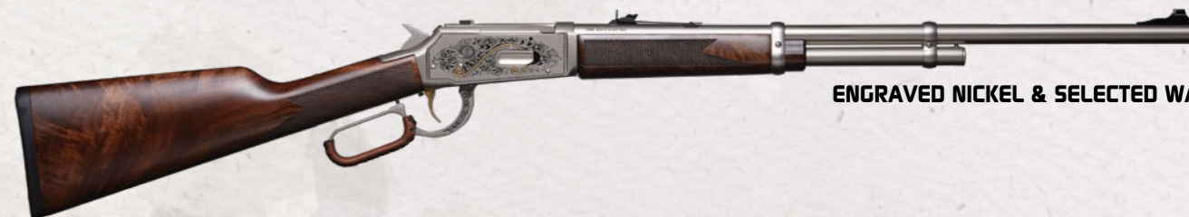
ENGRAVED NICKEL & SELECTED WALNUT