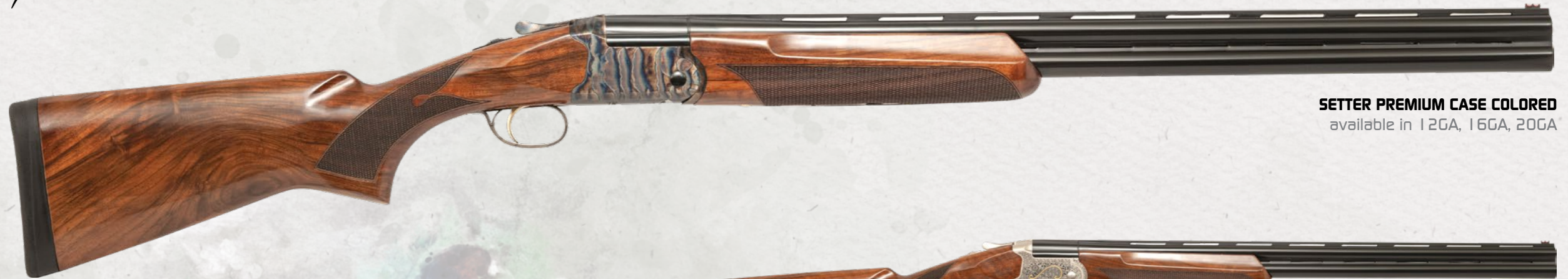
SETTER PREMIUM CASE COLORED available in 12GA, 16GA, 20GA

Here are the 'New Classics' from Khan Arms !