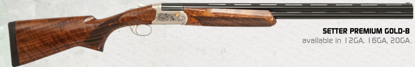
SETTER PREMIUM GOLD-B available in 12GA, 16GA, 20GA