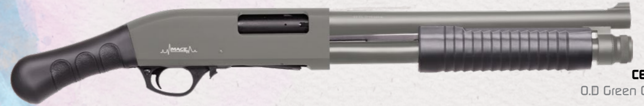
CERAKOTE O.D Green Cerakote