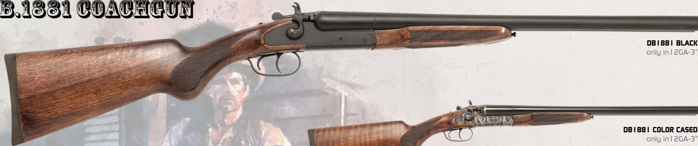
DB1881 BLACK only in 12GA-3"