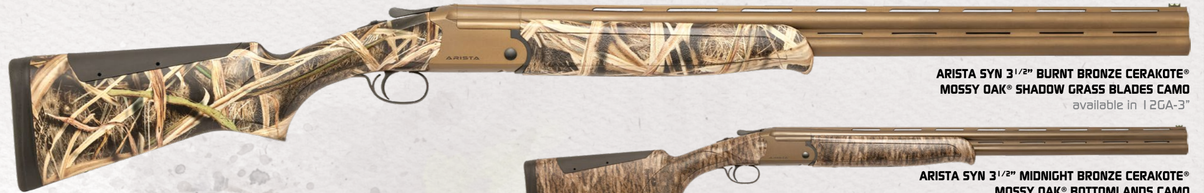
ARISTA SYN 3 1/2" BURNT BRONZE CERAKOTE® MOSSY OAK® SHADOW GRASS BLADES CAMO available in 12GA-3"