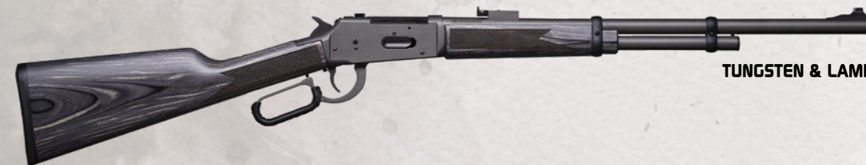
TUNGSTEN & LAMINATE WOOD