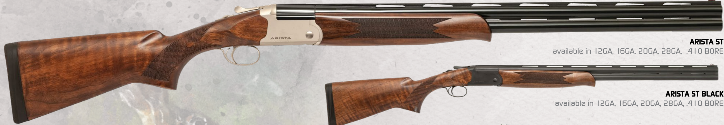
ARISTA ST available in 12GA, 16GA, 20GA, 28GA, .410 BORE