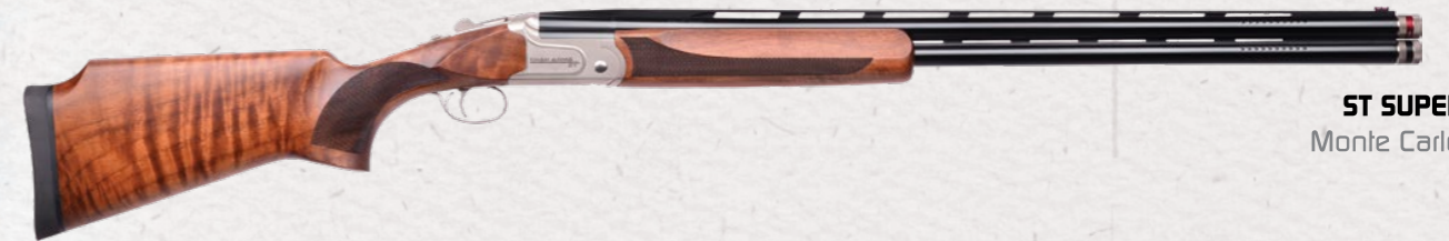
ST SUPER TRAP Monte Carlo Stock