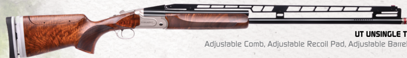
UT UNSINGLE TRAP

Removeable Trigger(DLX), Adjustable Comb, Adjustable Recoil Pad, Adjustable Barrel Rib