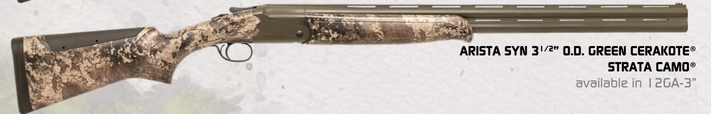
ARISTA SYN 3 1/2" O.D. GREEN CERAKOTE® STRATA CAMO® available in 12GA-3"