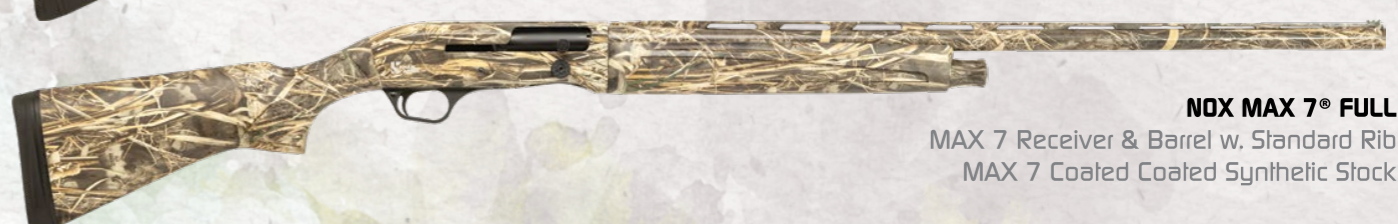
NOX MAX 7® FULL MAX 7 Receiver & Barrel w. Standard Rib MAX 7 Coated Coated Synthetic Stock