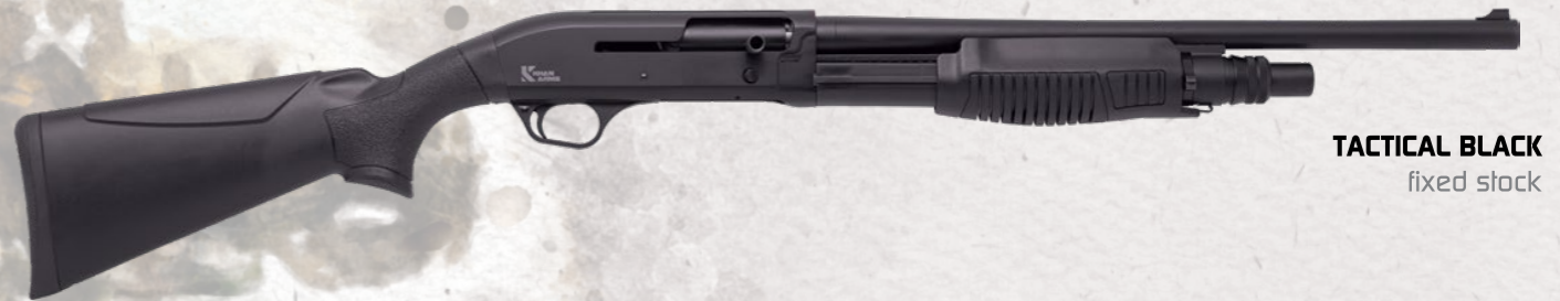
TACTICAL BLACK fixed stock

DUO-SYS offers the option of converting between Semi-Auto / Pump-Action operation modes in a matter of seconds.