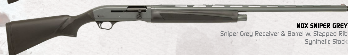
NOX SNIPER GREY Sniper Grey Receiver & Barrel w. Stepped Rib Synthetic Stock