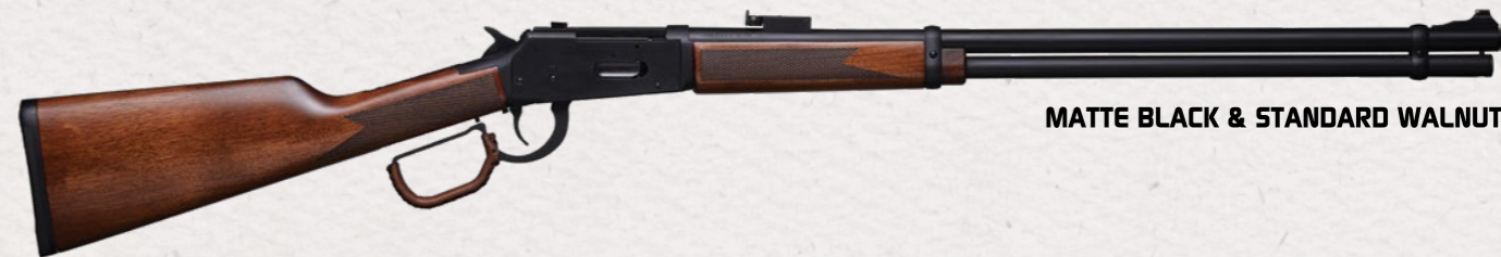
MATTE BLACK & STANDARD WALNUT