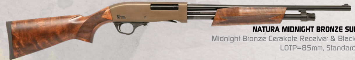
NATURA MIDNIGHT BRONZE SUPER COMPACT Midnight Bronze Cerakote Receiver & Black Barrel-47 cm LOTP=85mm, Standard Walnut Stock