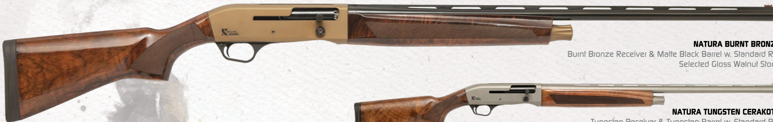
NATURA BURNT BRONZE Burnt Bronze Receiver & Matte Black Barrel w. Standard Rib Selected Gloss Walnut Stock