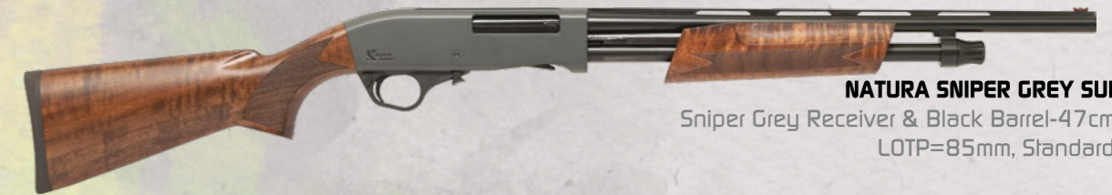
NATURA SNIPER GREY SUPER COMPACT Sniper Grey Receiver & Black Barrel-47cm Standard Rib LOTP=85mm, Standard Walnut Stock

PXS is the petite and elegant pump-action shotgun line built on a true .410 frame by Khan Arms.