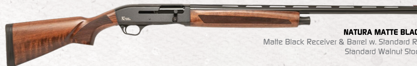
NATURA MATTE BLACK Matte Black Receiver & Barrel w. Standard Rib Standard Walnut Stock