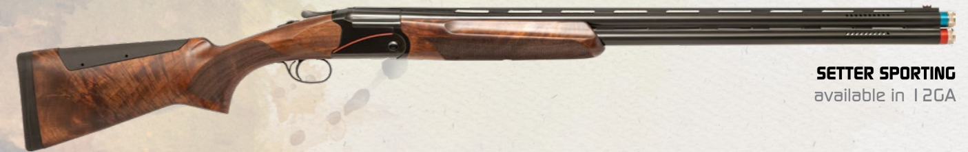
SETTER SPORTING available in 12GA

Ported barrel is optional on this model.