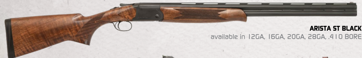
ARISTA ST BLACK available in 12GA, 16GA, 20GA, 28GA, .410 BORE