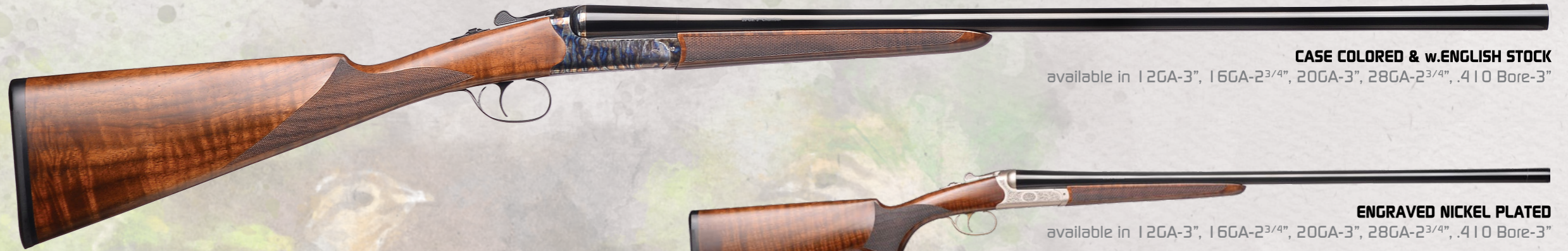
CASE COLORED & w.ENGLISH STOCK available in 12GA-3", 16GA-2 3 / 4 ", 20GA-3", 28GA-2 3 / 4 ", .410 Bore-3"