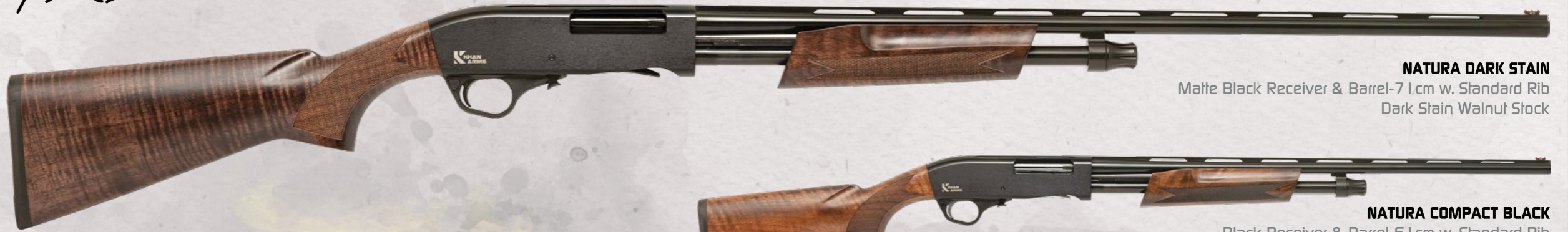
NATURA DARK STAIN Matte Black Receiver & Barrel-71 cm w. Standard Rib Dark Stain Walnut Stock