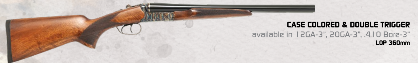
CASE COLORED & DOUBLE TRIGGER available in 12GA-3", 20GA-3", .410 Bore-3" LOP 360mm

K-005 is at the top of the line, delivering performance in elegance;