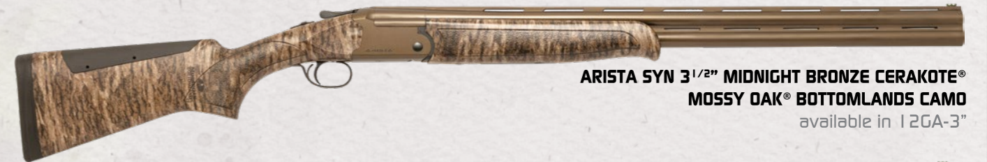
ARISTA SYN 3 1/2" MIDNIGHT BRONZE CERAKOTE® MOSSY OAK® BOTTOMLANDS CAMO available in 12GA-3"