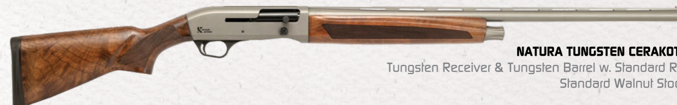
NATURA TUNGSTEN CERAKOTE Tungsten Receiver & Tungsten Barrel w. Standard Rib Standard Walnut Stock