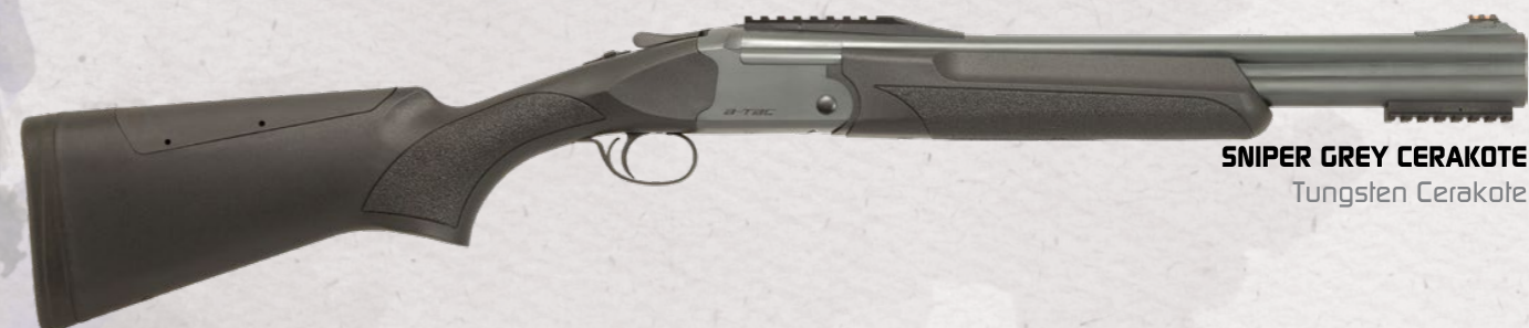
SNIPER GREY CERAKOTE Tungsten Cerakote

An easy to operate over&under shotgun with a short barrel equipped with picatinny rails and fiber optic front sights.