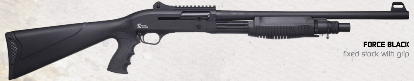
FORCE BLACK fixed stock with grip