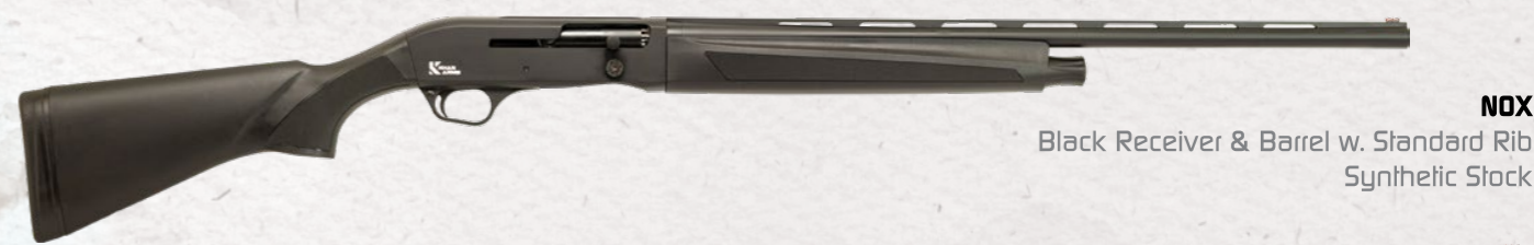
NOX Black Receiver & Barrel w. Standard Rib Synthetic Stock

COMPETITORS are also kinetic system shotguns, with different recoil pad designs and materials)