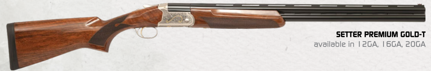
SETTER PREMIUM GOLD-T available in 12GA, 16GA, 20GA

They all feature a Single Selective Trigger and an LPA® Fiber Optic Bar Front Sight. 'Length of Pull' 'Trigger Pull Weight' & 'Forend Latch Tightness' can be adjusted/customized.