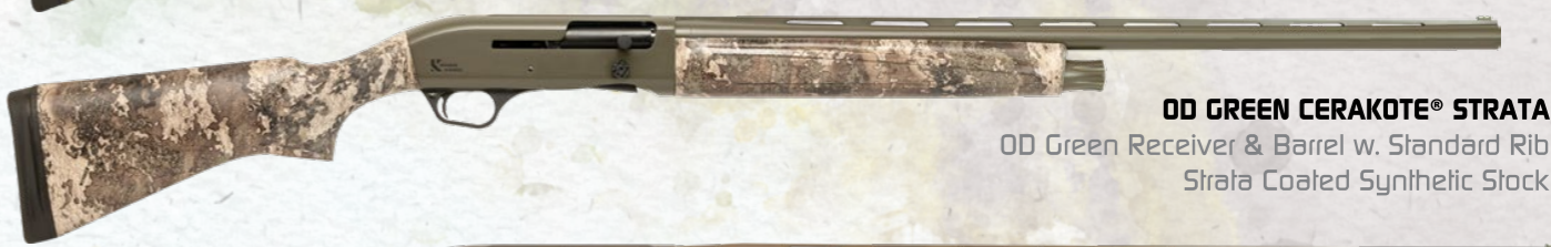
OD GREEN CERAKOTE® STRATA OD Green Receiver & Barrel w. Standard Rib Strata Coated Synthetic Stock