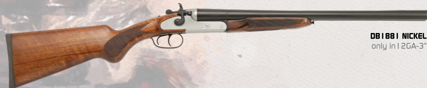
DB1881 NICKEL only in 12GA-3"

Classic Exposed Hammer Coach Gun: Your Trusted Companion for Home Defense and Cowboy Action.