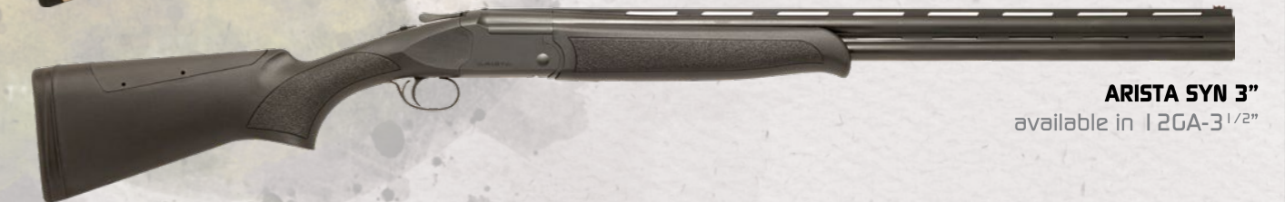
ARISTA SYN 3" available in 12GA-3 1/2"

ARISTA line of products offer you simplicity and functionality;