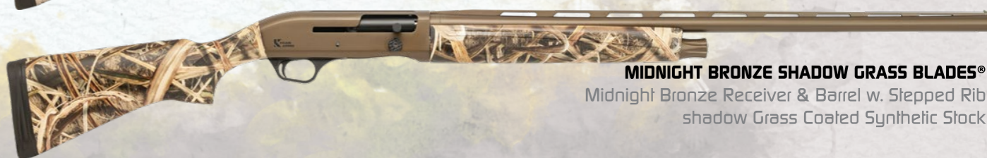
MIDNIGHT BRONZE SHADOW GRASS BLADES® Midnight Bronze Receiver & Barrel w. Stepped Rib shadow Grass Coated Synthetic Stock